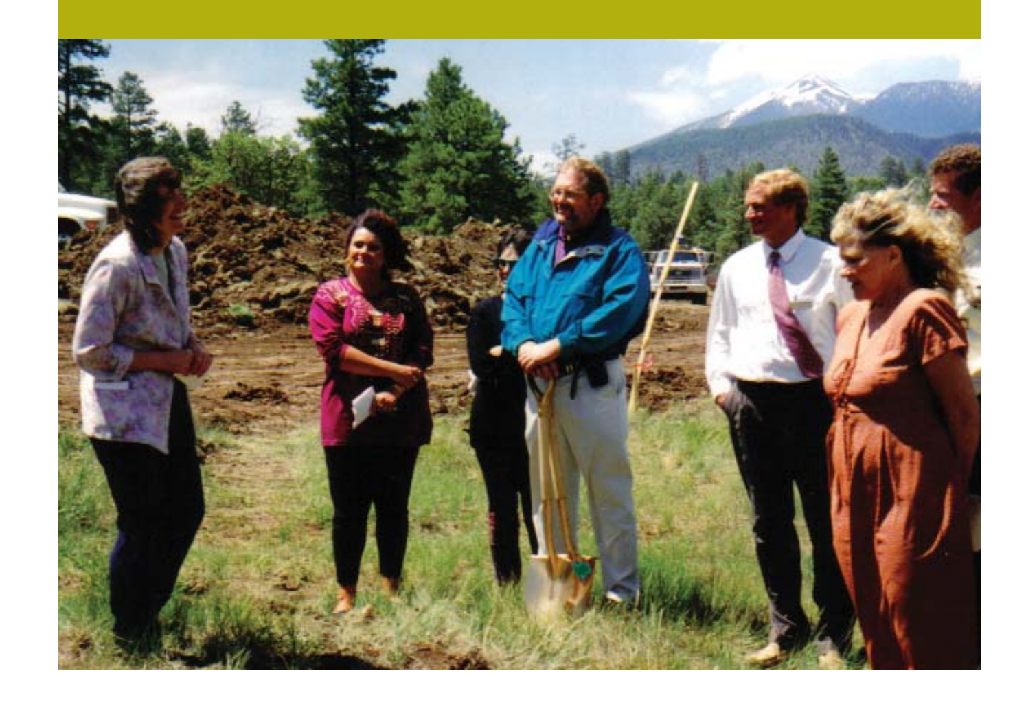
truly makes her a Housing Hero.