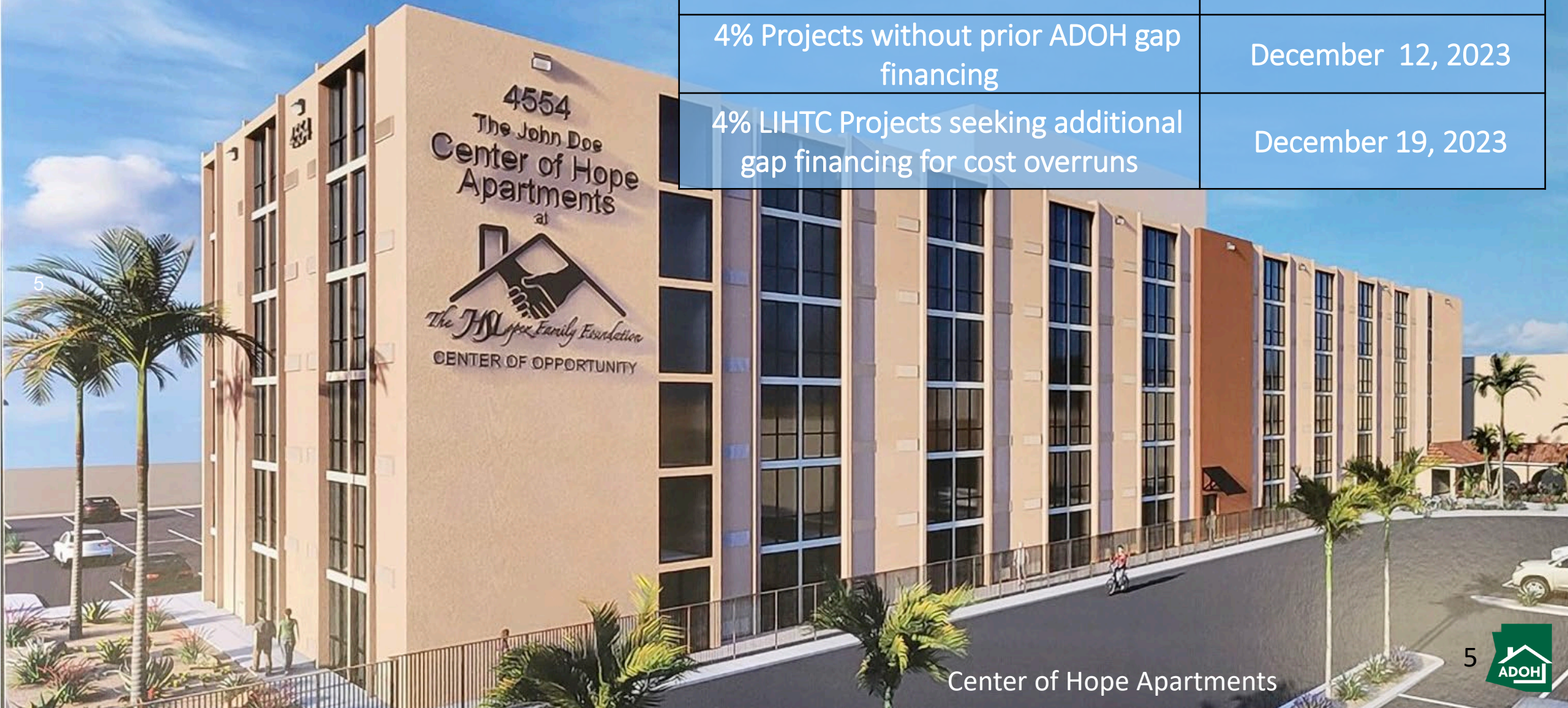
Center of Hope Apartments