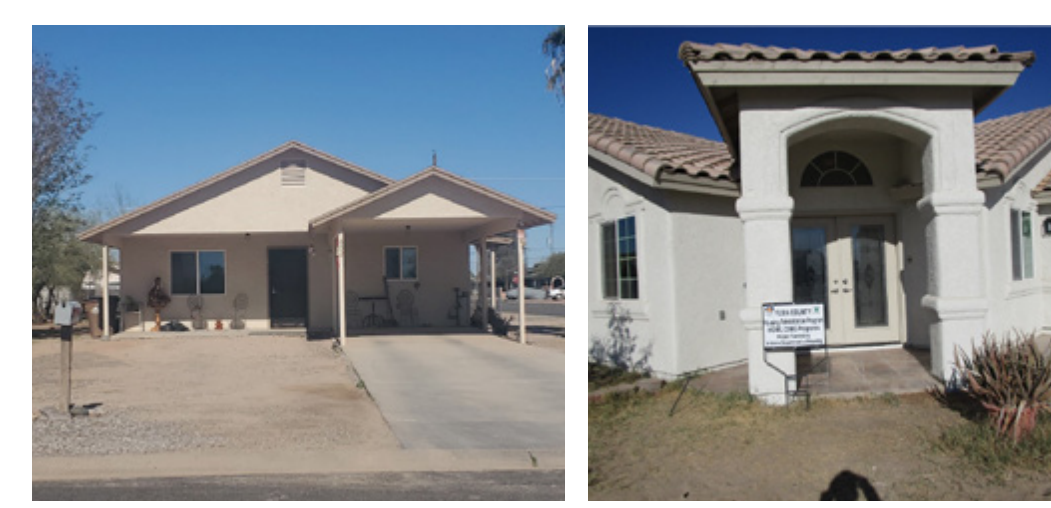
Eloy Housing Rehab Project (After)