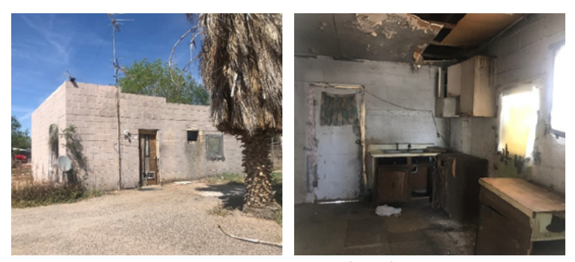
Eloy Housing Rehab Project (Before)