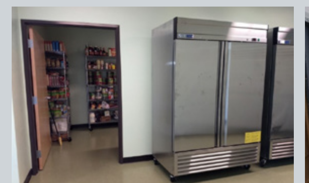
Show Low Senior Center Kitchen/Pantry

Individuals throughout rural Arizona reached through community development project commitments