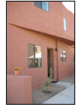
Before and after photos of units at Glenn Verde.

of Housing's Housing Economic Recovery Act (HERA). In a little more than one year, La Frontera Arizona completely revitalized the