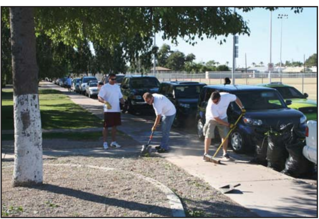
Taylor Morrison employees donated their time to clean up eight apartment units for families in need including painting, landscape maintenance, window washing and general improvements.