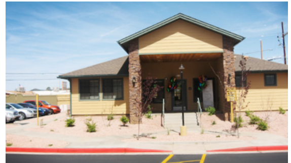
Center Ridge is a 48-unit senior project (top); the club house holds a computer center and community room for residents' use (bottom);