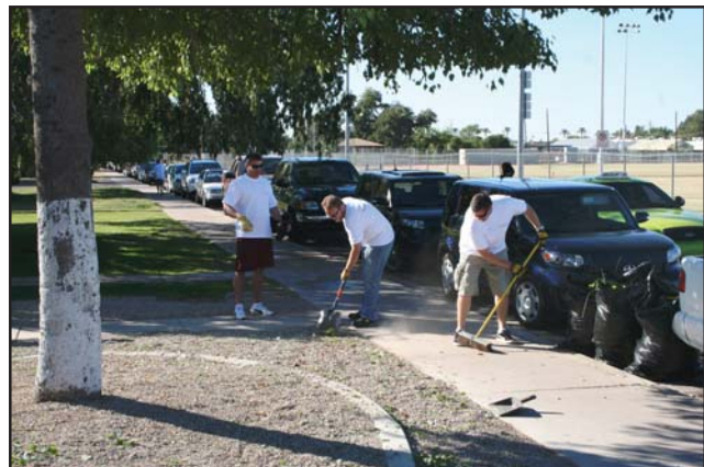
Taylor Morrison employees donated their time to clean up eight apartment units for families in need including painting, landscape maintenance, window washing and general improvements.