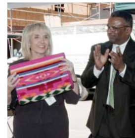
Gov. Brewer accepts a gift to commemorate the event while Dep. Sec. Sims looks on.

O n Tuesday, September 15, Governor Jan Brewer and HUD Deputy Secretary Ron Sims toured Catherine Arms, a multifamily rental development project made possible by federal stimulus dollars. The project, funded with a combination of federal, state and local dollars will serve individuals and families up to 50 percent of the area median income in downtown Phoenix when complete.