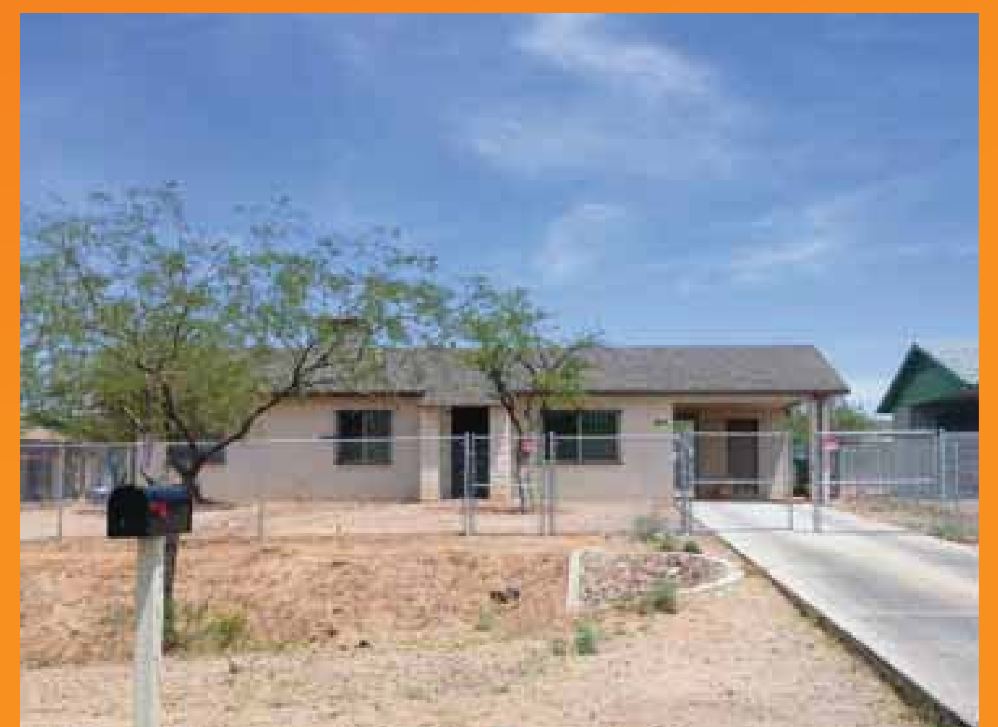
The Pascua Yaqui Tribe has provided three-, four-, and five- bedroom single family homes for its members to ease overcrowding.