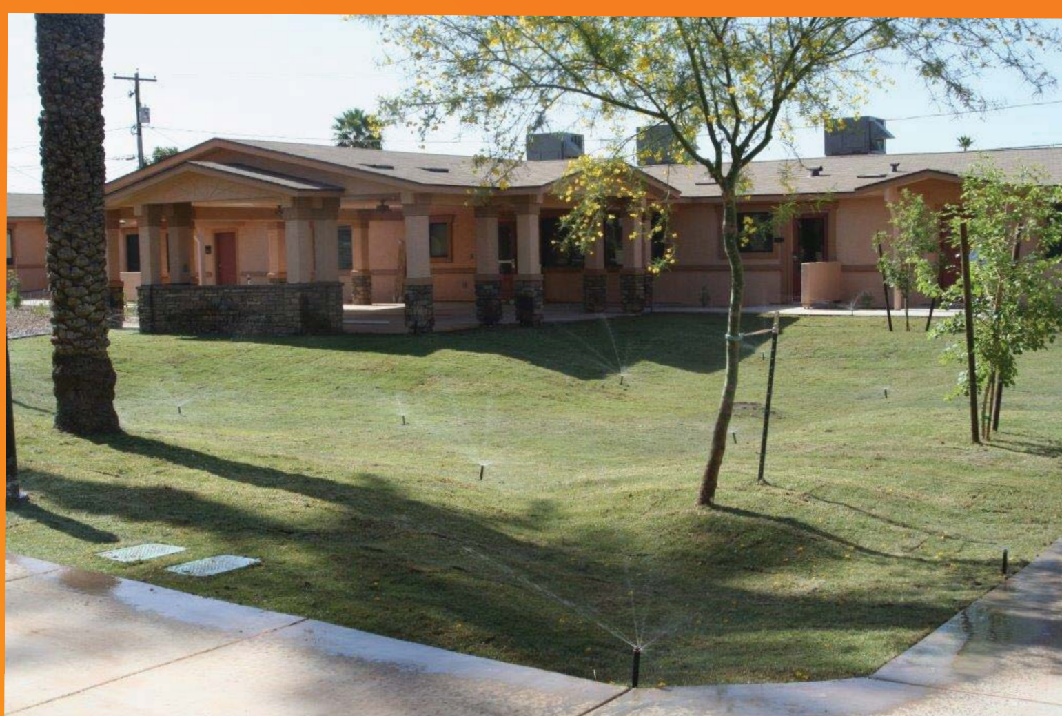
The 29 Palms property is universally designed, with a garden-style architecture to nurture independent and dignified living.

Over the next fifteen years, more than 500,000 children with autism disorders will become adults. Currently most adults with autism live with their parents. Autistic adults currently have few options for housing away from their families.