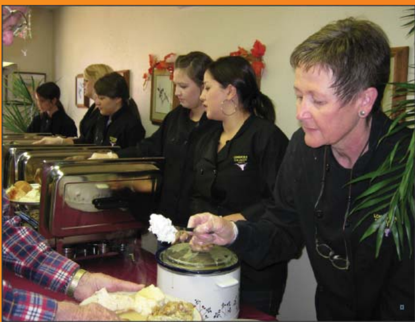
Pineview's annual Thanksgiving Day dinner prepared and served by the local high school culinary students was featured in the HUD annual report.

Housing Tax Credits and CHDO HOME funds from the Arizona Department of Housing to acquire and rehabilitate the existing apartments units and add 20 newly constructed apartment units to the campus. In addition, FSL received an award of Affordable Housing Program grant funds from the Federal Home Loan Bank of San Francisco in 2011.