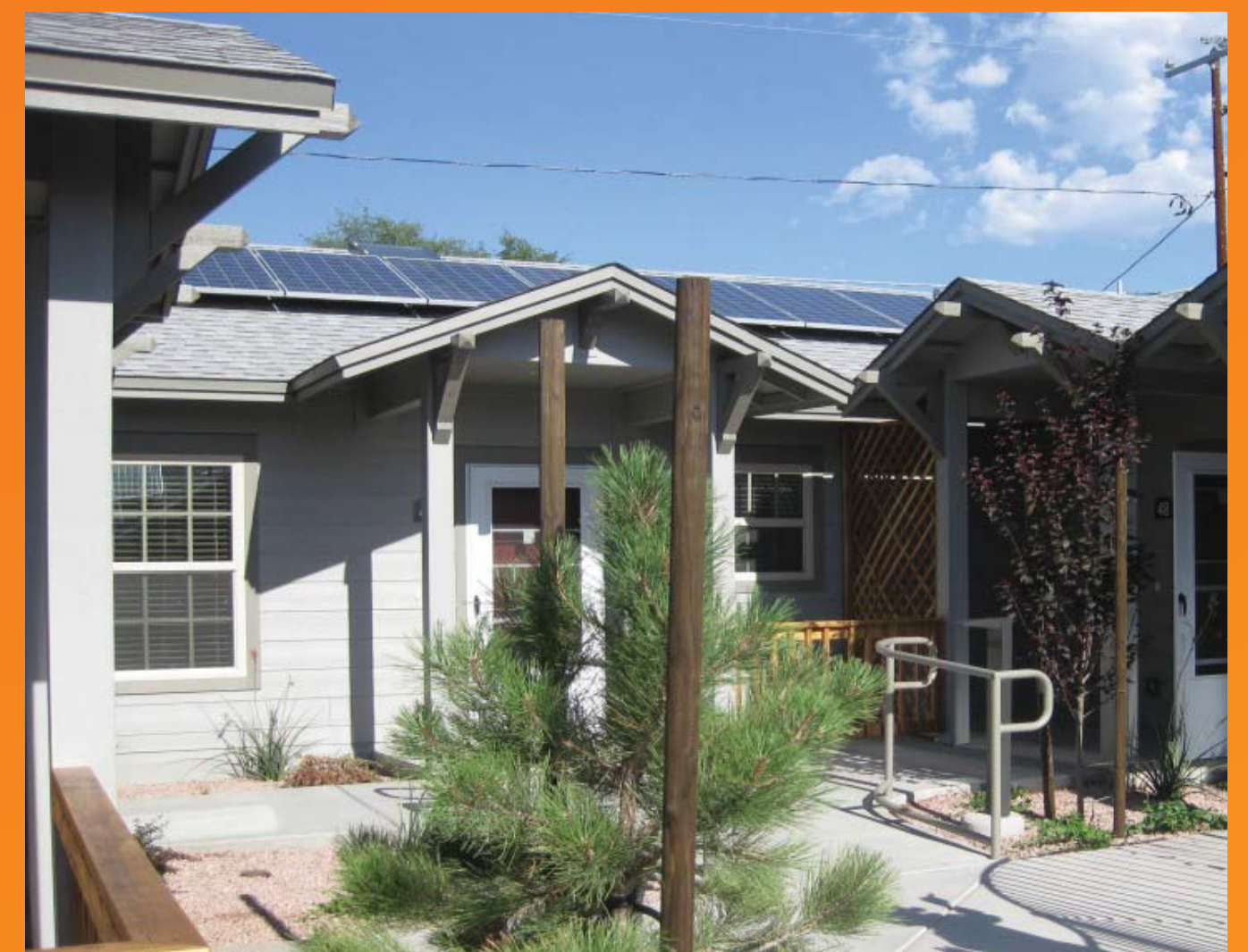
Pineview's residents are proud of the "green technology" the solar panels on their roofs represent.

Pineview represents all that is positive about a low income senior community. The project is comprised of 49 one and two bedroom apartment units, a Community Life Center, an on-site "Bark Park" and a gazebo. Pineview Manor serves seniors age 62 and older at 40%, 50% and 60% of Area Median Income in