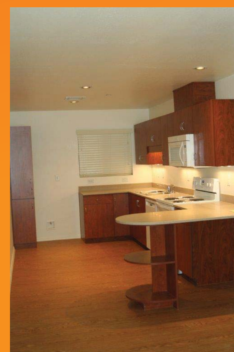
Refurbished units were designed to be responsive to the needs of adults with ASD who are living independently for the first time.

29 Palms Apartments is a newly refurbished, incredibly unique affordable multifamily housing property, co-locating fifteen apartments for seniors 55 and older with six apartments for adults with Autism Spectrum Disorder (ASD). The campus is universally designed, exhibiting garden-style architecture. 29 Palms Apartments nurtures independent and dignified living while providing the resources of a community with a community life center and a secured campus. The apartments will act as a beta site for the First Place Campus which is expected to break ground next year. The campus will include housing for young adults with autism, a two year tuition-based “transition academy” and a multi-use training facility for providers, professionals and physicians.