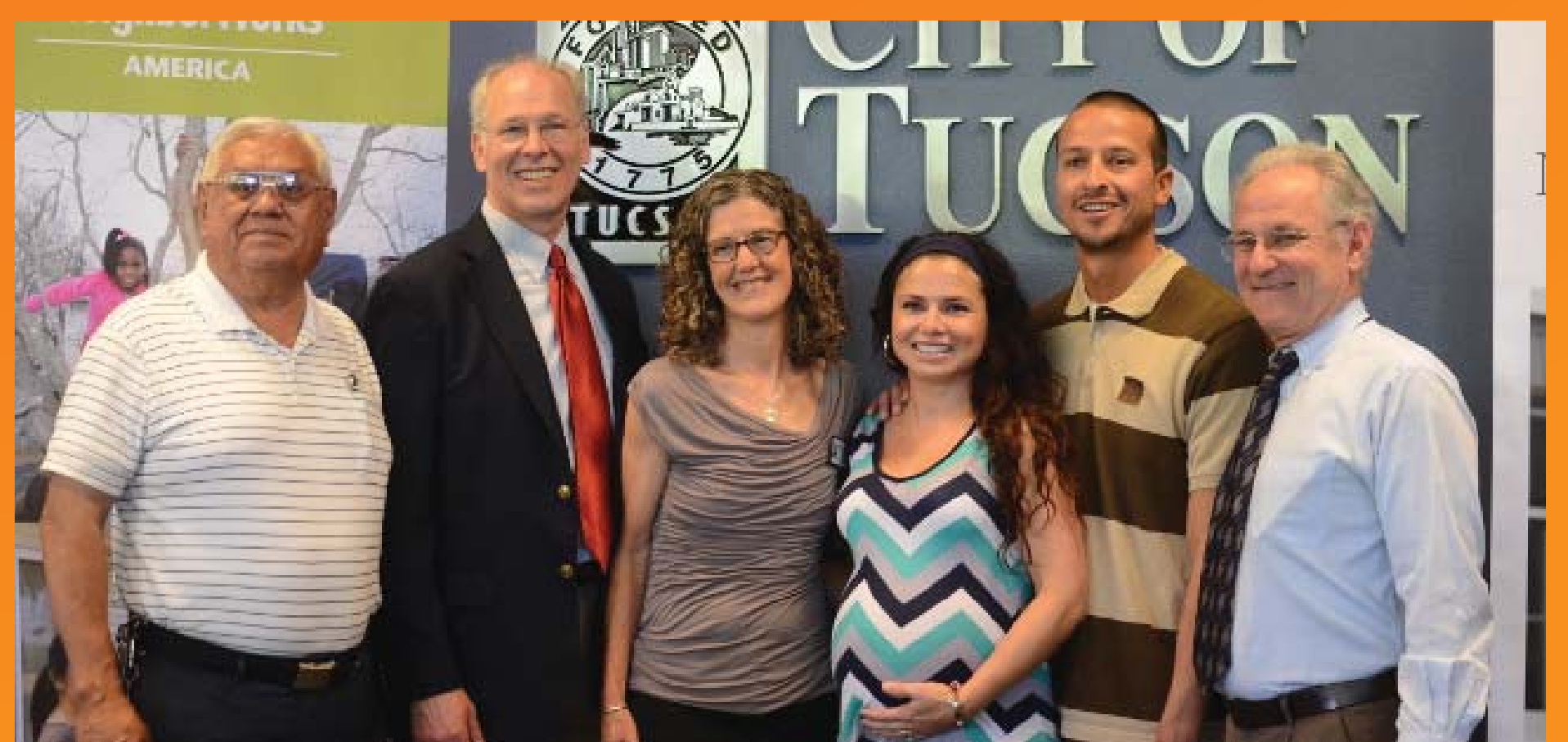
Mayor Rothschild and staff from Wells Fargo Bank kick-off the NeighborhoodLIFT program, a down payment assistance and financial education program for homebuyers.

The Department of Housing is pleased to celebrate Mayor Rothschild's efforts to ensure that the people of Tucson have a safe and decent place to call home.