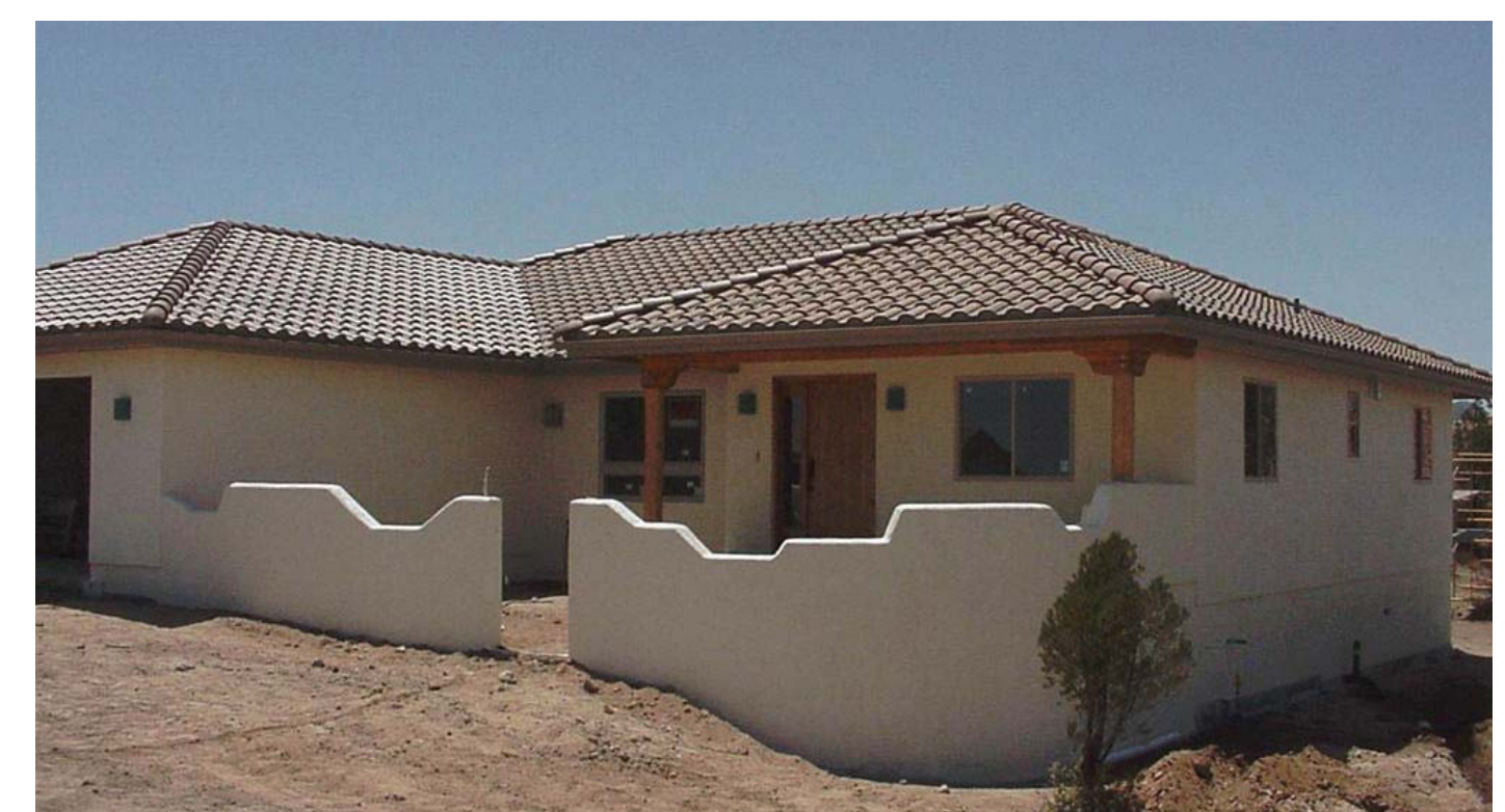
In addition to the Fox home (top photo), Yavapai College has partnered with the Prescott Area Habitat for Humanity to build these other affordable and energy/resource efficient homes in the Prescott area.