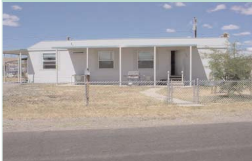
Both sets of photos show before (top) and after (bottom) photos of mobile home total replacements in the City of Bullhead.

Fortunately, for the current and future residents of Bullhead, the city understands housing as a broader community development strategy. The city has a history of investing in programs and projects that make Bullhead an even better place to live. Community Development Block Grant funds have been used for street improvements and lighting, a senior center, a community center, removal of architectural barriers, and a shelter for victims of domestic violence.