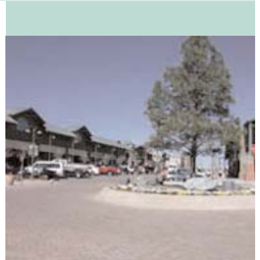
Prescott Gateway mall is one of the many highlights of the shopping experience in Prescott.

A housing crisis affects everyone - neighborhoods, businesses, towns, cities, and counties. It's not "somebody else's" issue, it's everybody's issue. The Prescott Chamber of Commerce recognizes this through their Workforce Housing Solutions Program - and for that, the Arizona Department of Housing is pleased to present this 2005 Housing Hero Award.