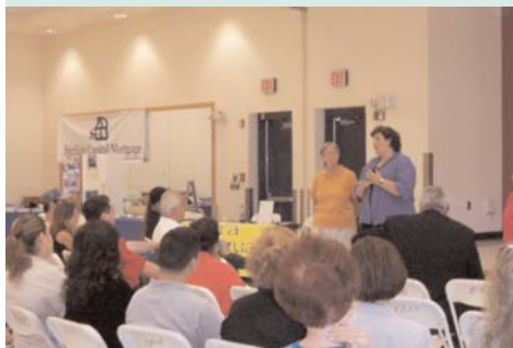
Housing Arizona's Workforce (HAW) class in Phoenix.

The Foundation provides financial and indirect support to Arizona's 22 local REALTOR® associations that are involved in local housing programs. A wealth of housing information and homebuyer education tools can be found on ARHNF's website, accessible to both its members and the general public.