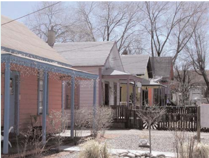
The colorful shops and galleries of the McCormick Arts district add their own flair to Prescott's downtown.

Prescott is in central Arizona amid the largest stand of Ponderosa Pine in the world; its four seasons offer just enough variation to make the weather both moderate and interesting. Over 700 homes and businesses in Prescott are listed on the National Register of Historic Places. Its granite courthouse set among green lawns and spreading trees reflects the Midwestern and New England background of Prescott's early pioneers, thus coining the phrase "Everybody's Hometown."