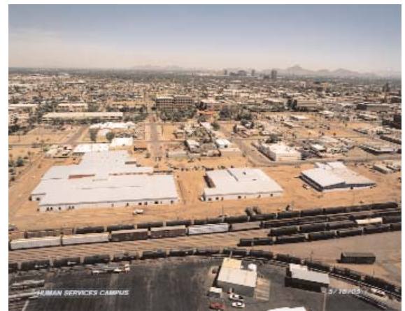
An artist's rendering of the campus (top) and an aerial photograph taken in May, 2005 (bottom).

“The problem of homelessness is complicated and cannot be solved by just one organization alone. The Human Services Campus is, in the purest sense, a community.”