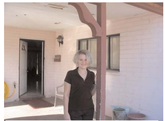
First-time homebuyer assisted through ARHNF program.